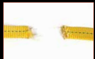
SHARP EDGE FAILURE: Traditional webbing lifeline