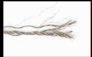
SHARP EDGE FAILURE: Traditional cable lifeline with energy absorber